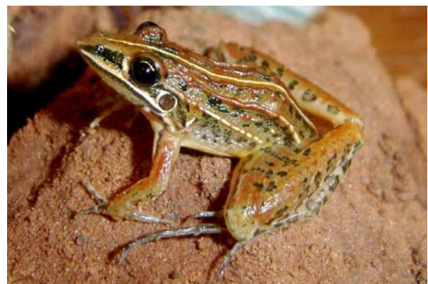
Figure 1. Leptodactylus furnarius (DZ 2678), adult from Cacequi, Rio Grande do Sul, Brazil.

Garcia and Vinciprova (2003) included L. furnarius in the Data Deficient (DD) category in a list of the threatened fauna of Rio Grande do Sul. They attribute the rarity of this taxon mainly to the lack of more intense surveys in areas of probable occurrence of this species in the state.