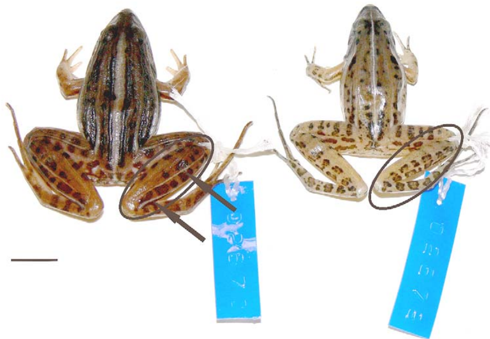
Figure 3. Main morphological differences between Leptodactylus gracilis (left), UFRGS 02673, from São Sepé, Rio Grande do Sul, and Leptodactylus furnarius (right), UFRGS 02678, collected in Cacequi, Rio Grande do Sul, indicated by black arrows and ellipsis. Note the presence of white stripes in the dorsal surface of the shank of L. gracilis , which are absent in L. furnarius . The scale bar represents 10 mm.